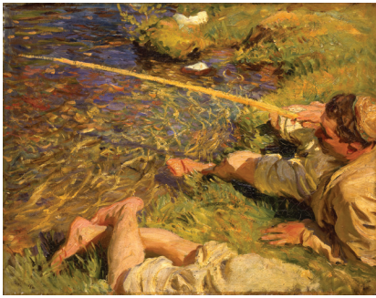
John Singer Sargent (American, 1856–1925). Val d'Aosta: A Man Fishing, c. 1907.

At about the time he painted A Man Fishing , Sargent closed his art studio and abandoned the portraiture for which he was so well known, to focus instead on architecture and landscapes. In this, perhaps one of his few later works involving human subjects, a man has positioned himself to avoid as much movement and expend as little energy as possible in the act of fishing. It is a quintessential summer moment, with the viewer placed on a bank overlooking the stream, as though gazing one last time at the ripples of water before turning away.